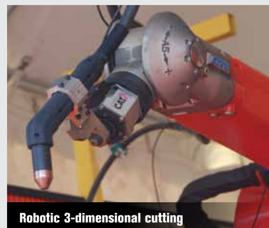
Robotic 3-dimensional cutting