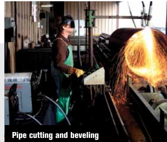
Pipe cutting and beveling