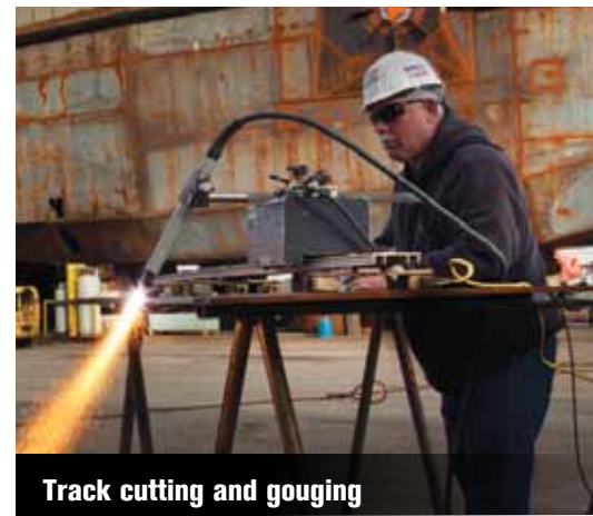
Track cutting and gouging

*20:1, 21.1:1, 30:1, 40:1, and 50:1 ratios